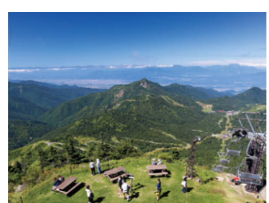
Mt. Kasagatake and Japan Northern Alps viewed from the top of Mt. Yokoteyama

after that. The surrounding environment is home to various alpine and alpine plants. Day lilies and willow herbs wave in the wind at the altitude of 2000m. You can see Japanese monkeys, serows, red foxes, raccoon dogs, chestnut tiger butterflies which come across the sea, and Japan's No.1 Genji fireflies in the ShigaKogen mountains. Some of the mountains are higher than 2000m, so trekkers can enjoy trekking. Mt. UraShigayama and Mt. Akaishiyama are popular courses to catch a view of the mystic beauty Onumake Pond (picture above). Mt. Yokoteyama and Mt. Higashidateyama get visited by many visitors and you can reach the summit by taking lifts or gondolas to enjoy the view of Northern Alps. It is very rare that the temperature goes above 30C during the summer time so there are no sultry nights. Train-