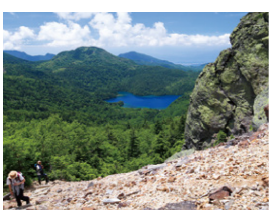
Overlooking Onuma-ike Pond from the top of Mt. Akaishiyama