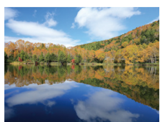
Autumn leaves of Kido-ike Pond